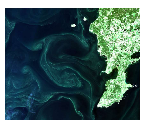
Fig. 3: The Sentinel 2 scene from 24 August 2016 shows filigree Cyanobacteria- filaments south-west of Gotland with a spatial resolution of 10 m.

The strong warming in the late spring led not only to the positive anomalies in May and June, but also to an early development of cyanobacteria. Measurements during the monitor cruise around 20 May have confirmed the satellite observations. A strong warming in the second half of July made 26 July to the warmest day