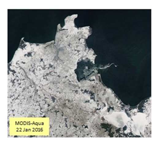
Fig. 2: MODIS Aqua quasi true colour image on 22 Jan 2016 shows the eastern part of the German Baltic Sea coast at the time of maximum ice coverage in the entire Baltic.

A strong cooling at the beginning of the year 2016 led to ice in the German inner coastal water already on 6 January, continued until 23 January and thus ensured early maximum ice cover in the entire Baltic Sea in 2016. MODIS Aqua from 22 January 2016 shows the ice conditions in the inner German coastal waters from the Darss-Zingst Bodden Chain to the Szczecin Lagoon. The week from 9 to 15 March was the coldest week in the entire open Baltic Sea.